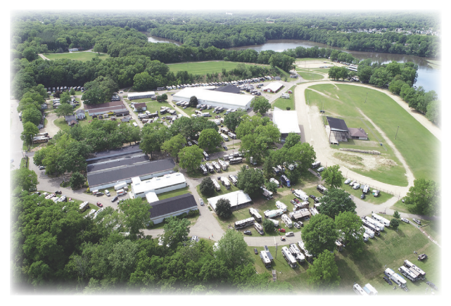
Family Motor Coach Association RV Rally pictured above