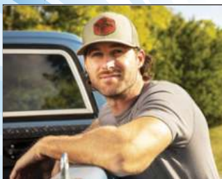
RILEY GREEN with Drake Milligan